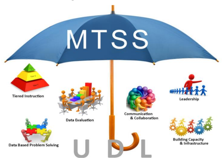
Figure 2: MTSS Core Principles